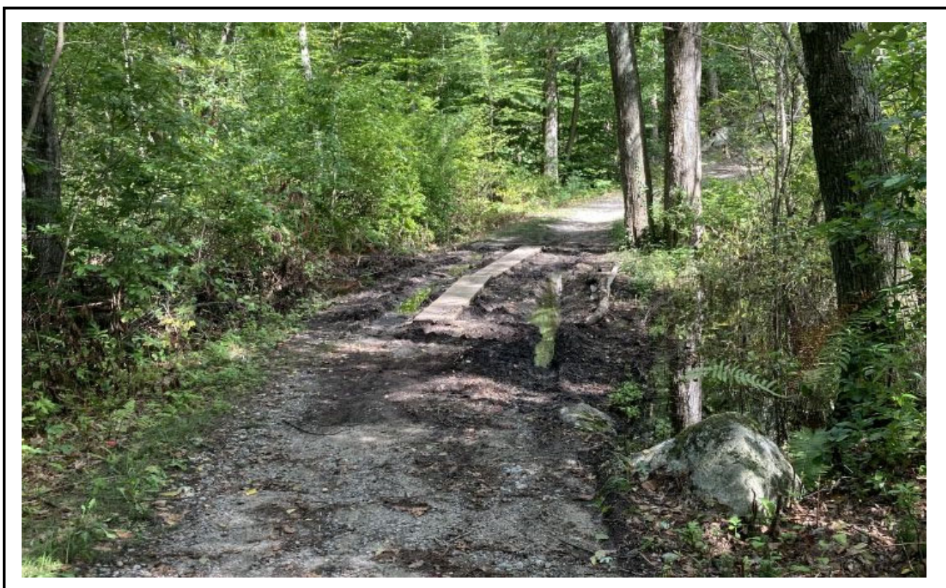
Photo #1: View of the Project Area on High Rock Road. BVWs are present to the left and right of the road. Facing east .