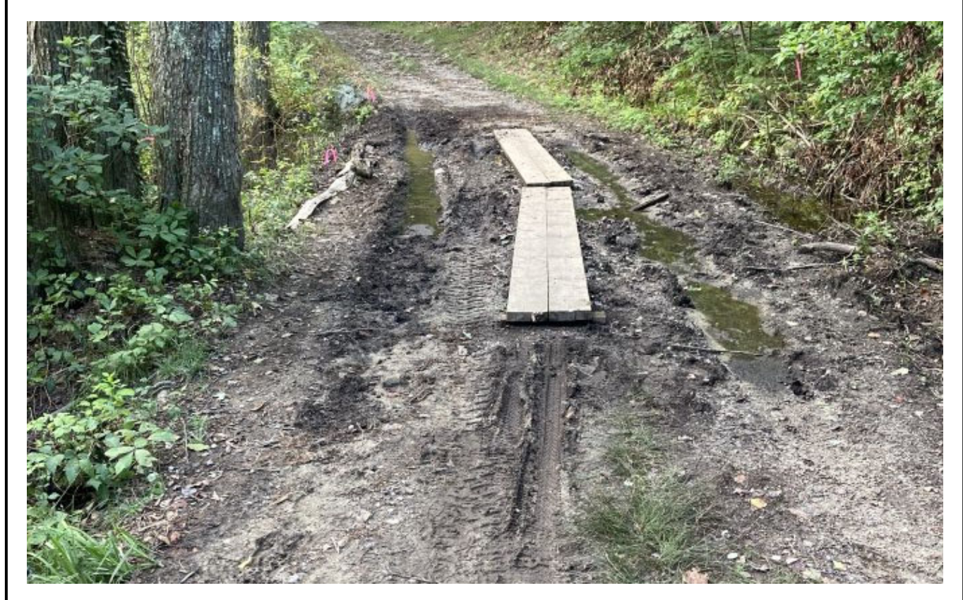
Photo #2: Closer view of the Project Area (inner 10-feet of the existing 14-foot wide fire road).