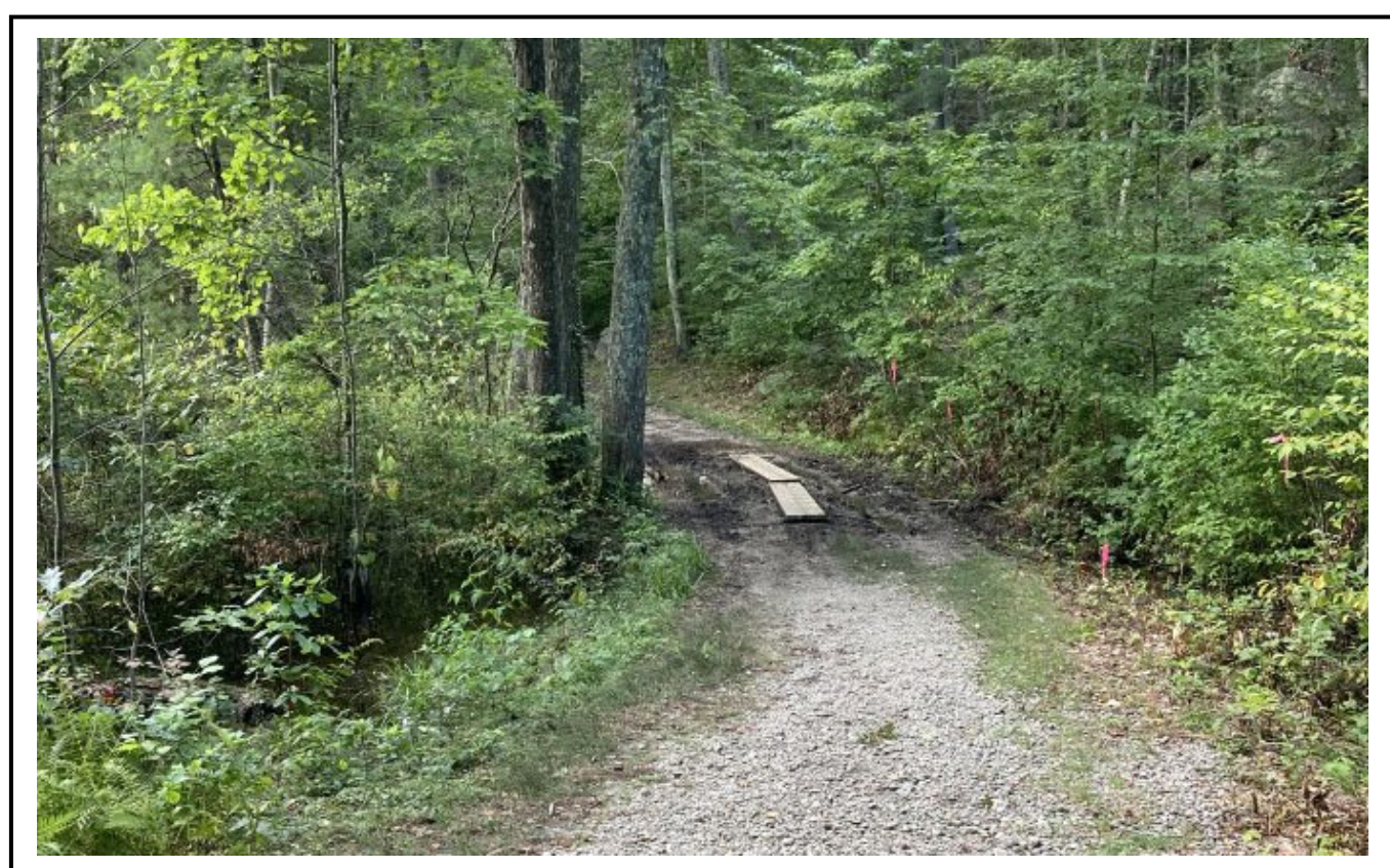
Photo #3: view of the Project area from the eastern approach. Facing west.