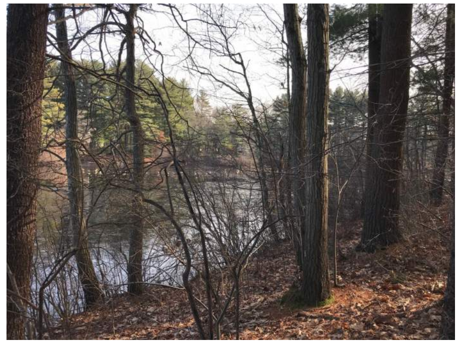
Photo 8: Typical view of Bank and 25' No Activity Zone at east side of peninsula, outside LOD