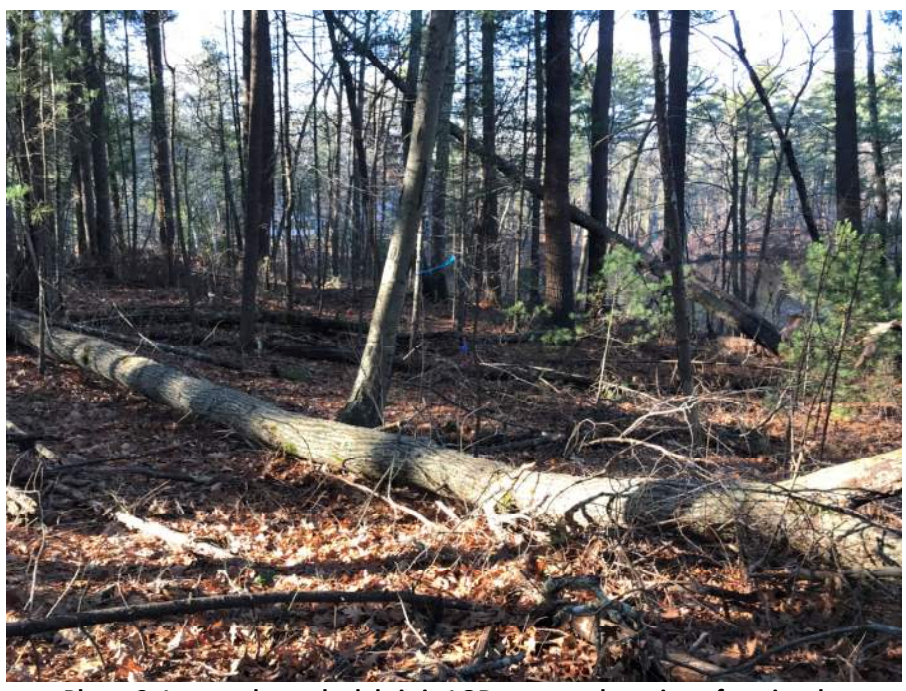
Photo 3: Logs and woody debris in LOD at central portion of peninsula.