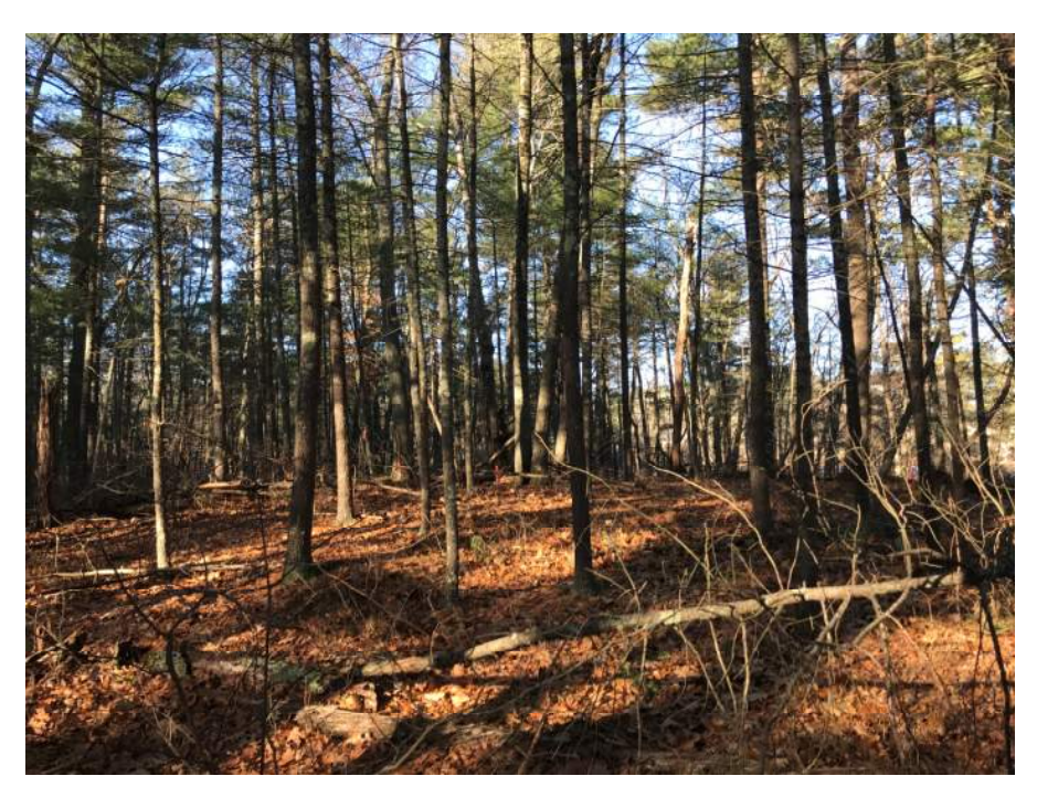
Photo 1: Typical view of peninsula interior, facing north from south limit of clearing.