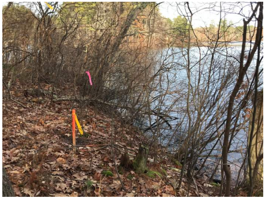
Photo 4: Location of pond access path and dock at northeast side of site.