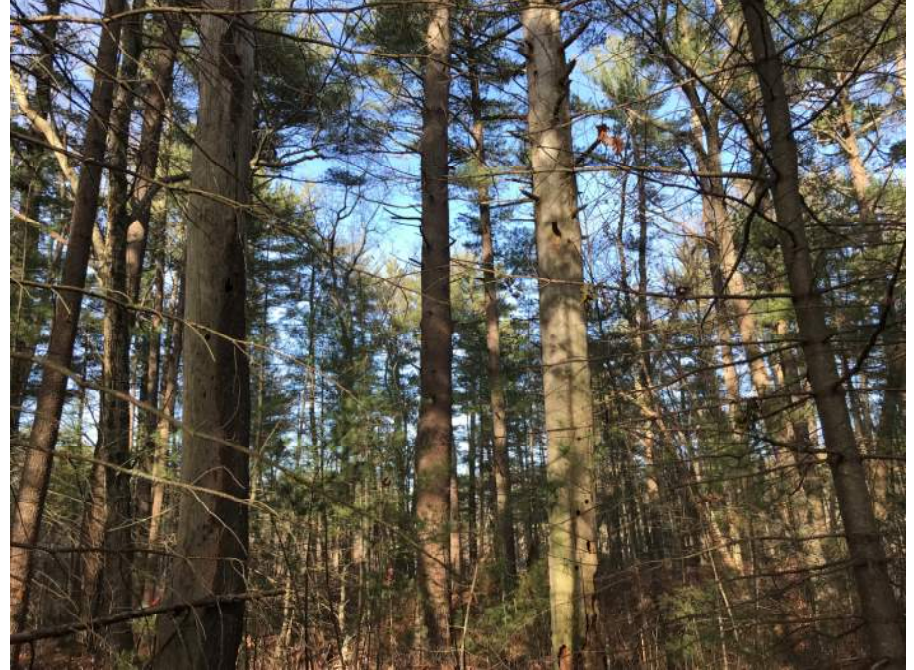
Photo 6: Wooded area east of driveway, including two 18" standing dead trees with cavities outside LOD