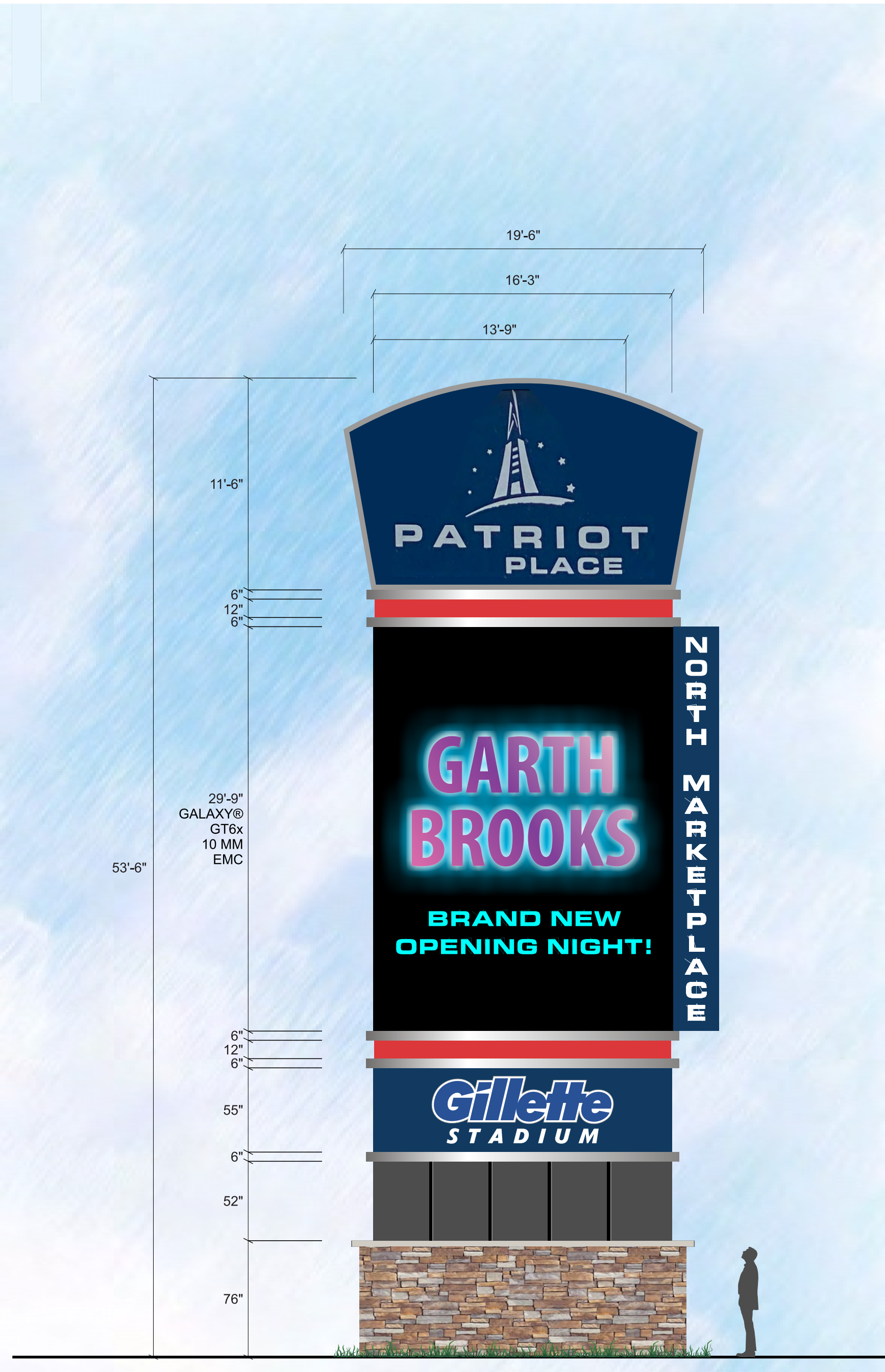
North Entrance Pylon Elevation Scale: 3/16" = 1'-0"

PROJECT: Gillette Stadium One Patriot Place, Foxborough, MA DRAWING # / FILE SAVE: Gillette Stadium\ North Entrance Pylon.cdr DRAWN BY: _____ DATE: _____ SCALE: 3/16" = 1'-0"