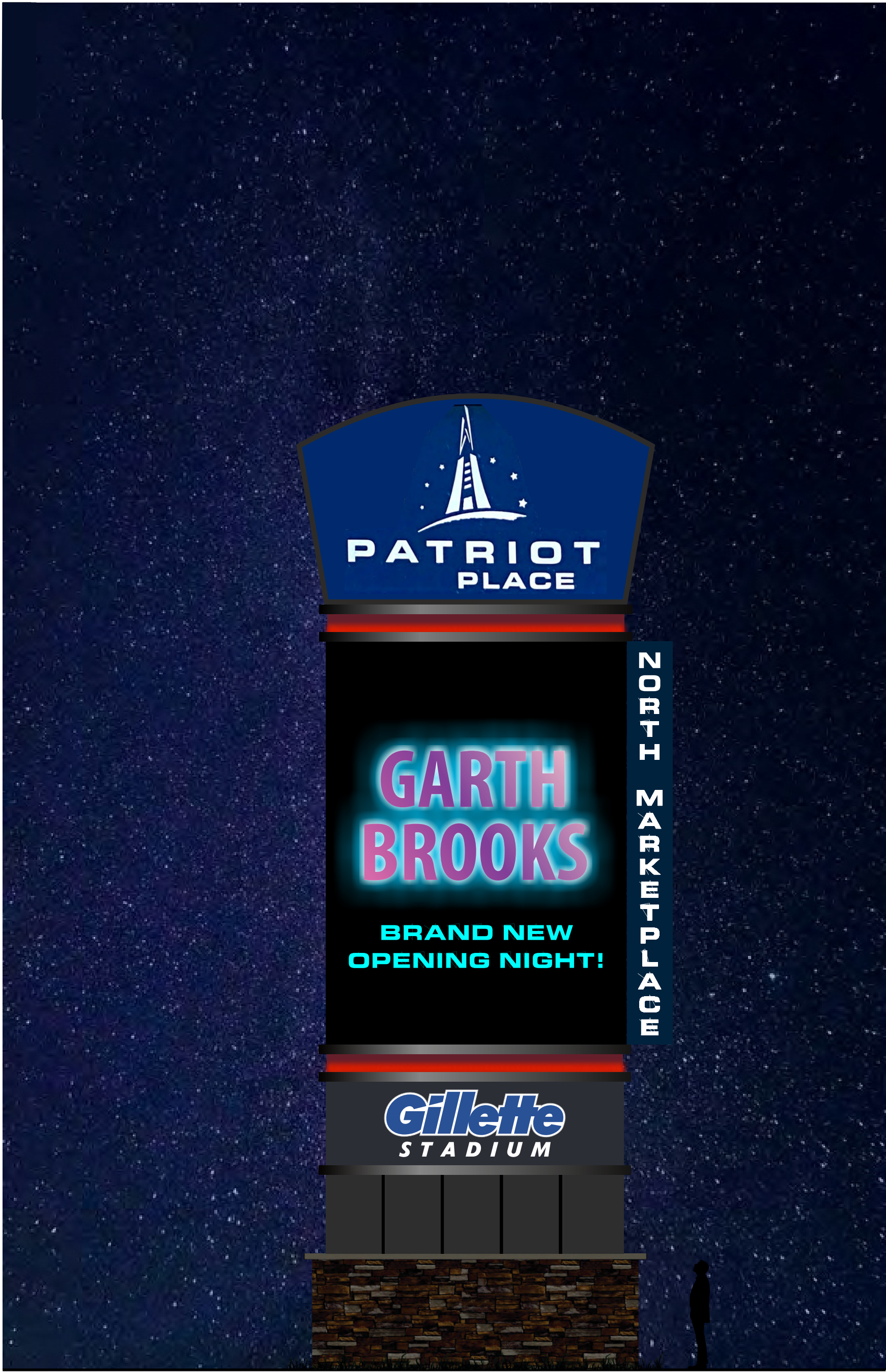
North Entrance Pylon Elevation Scale: 3/16" = 1'-0"

DRAWING # / FILE SAVE: Gillette Stadium\ North Entrance Pylon.cdr