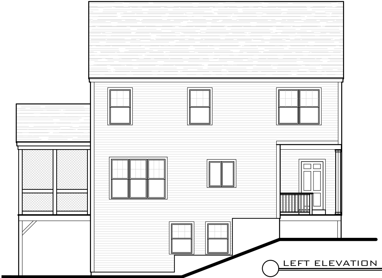
○ LEFT ELEVATION