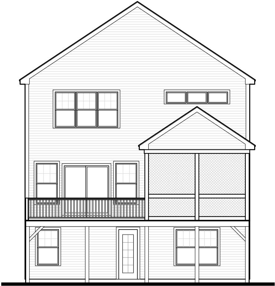
○ REAR ELEVATION