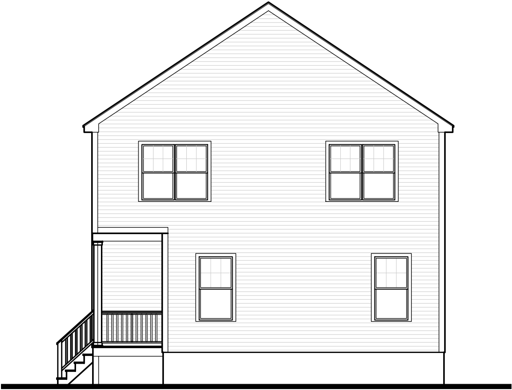
○ FRONT ELEVATION